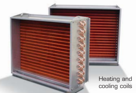
Heating and cooling coils