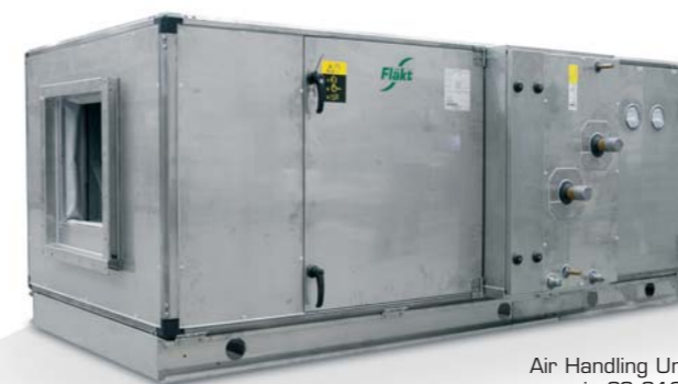
Air Handling Unit - in SS 316L